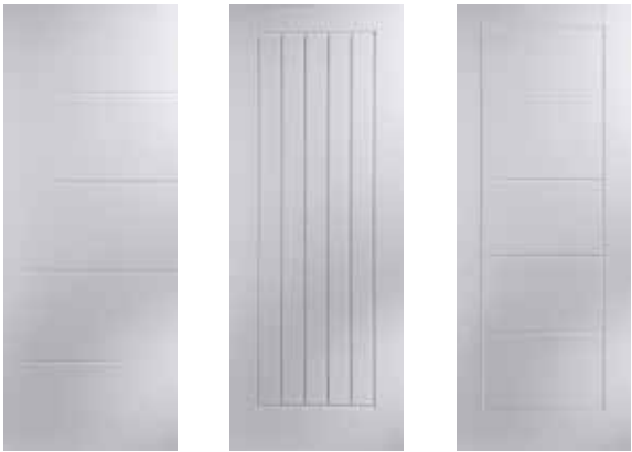
Linea Newark Ladder