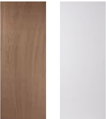
Paint Grade* Paint Grade Premium