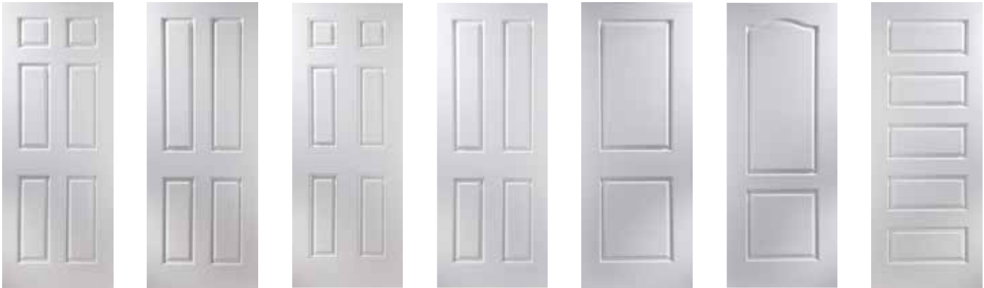
Bostonian Oakfield Arlington Atherton Cambridge Camden Rockport®