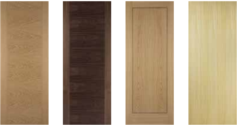
INLAY White Oak Koto