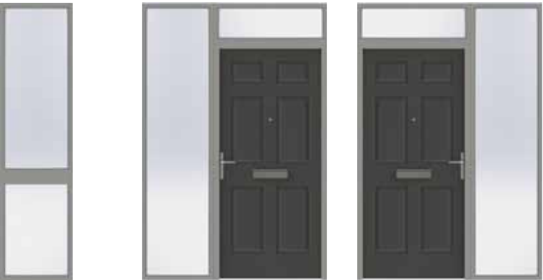
Side light with mid-rail Left hand single full length side light and top light Right hand single full length side light and top light

Glazed units are available in Clear, Opaque, Block Colour and Bevelled effect designs (Bevelled effect glass only available in EI30 glass options).