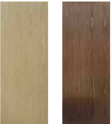
White Oak Walnut