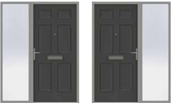
Left hand single side light Right hand single side light

In accordance with Building Regulations, the glass in a side light between a dwelling and an escape route is required to be insulated to aid the safe evacuation in the event of a fire. Further guidance can be found in Approved Document B.