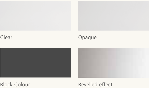
Clear Opaque Block Colour Bevelled effect

Block colour options are available on request in a wider range of colour finishes to meet the requirements of your project.