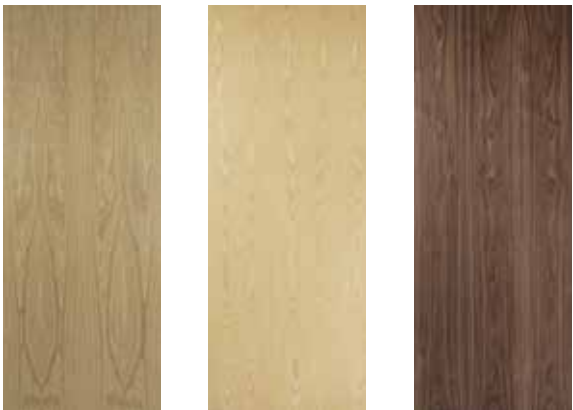
White Oak Ash Walnut