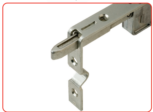
Shoot Bolt (optional)